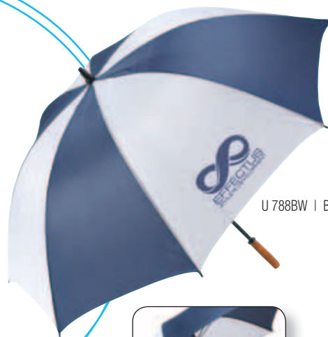
U 788BW | BLUE/WHITE