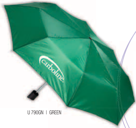
U 790GN | GREEN