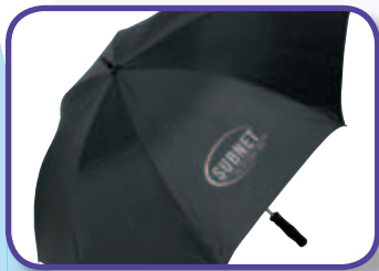
B785 UMBRELLA 250