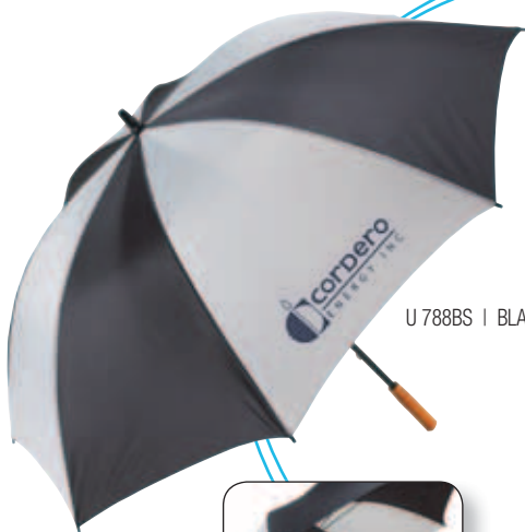
U 788BS | BLACK/SILVER