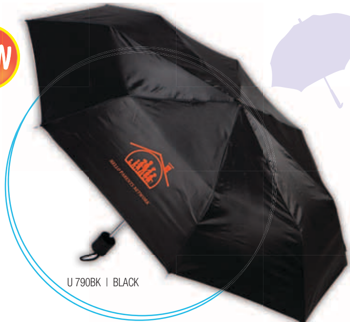
U 790BK | BLACK