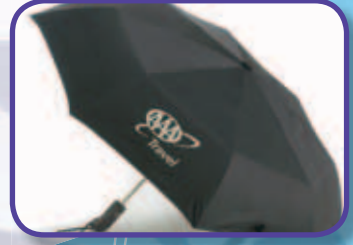
U792 UMBRELLA 251