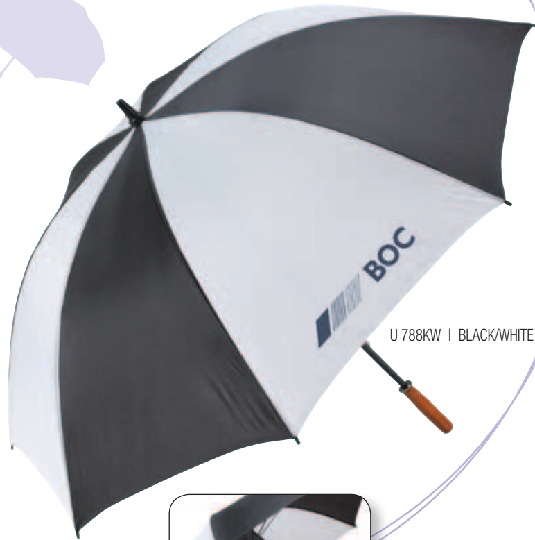
U 788KW | BLACK/WHITE