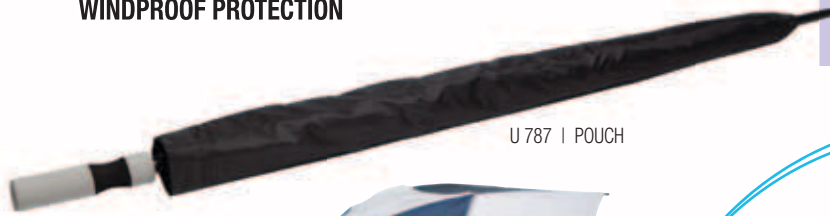
U 787 | POUCH