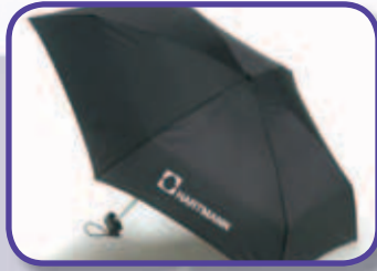
U791 UMBRELLA 251