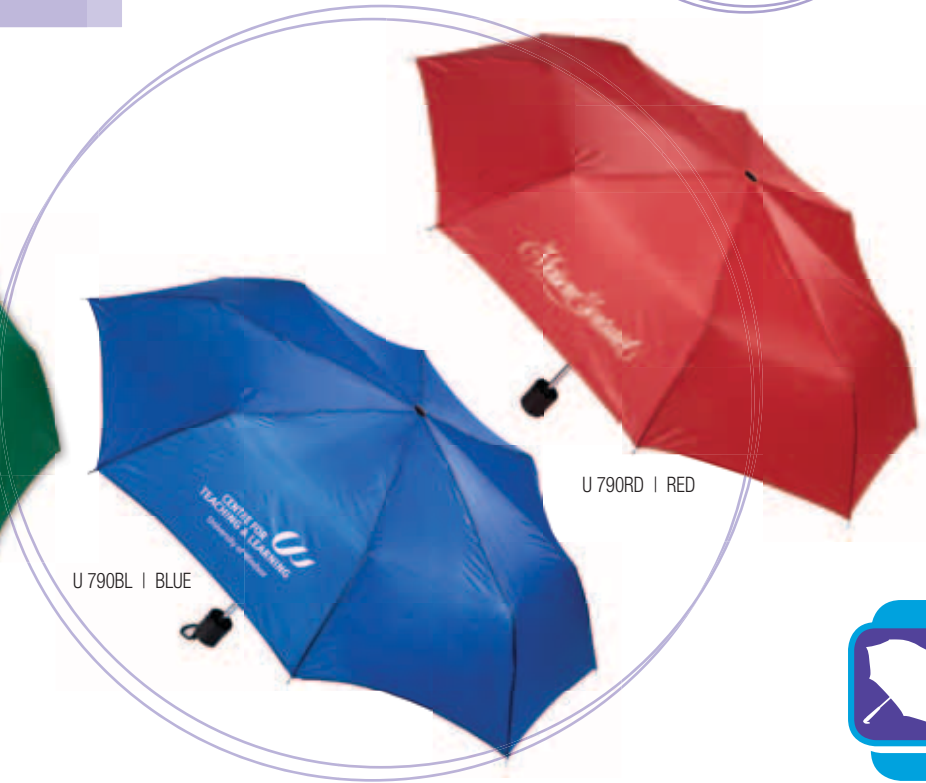
U 790BL | BLUE