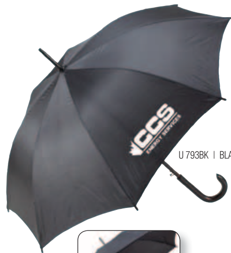
U 793BK | BLACK