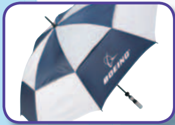
U787 UMBRELLA 252