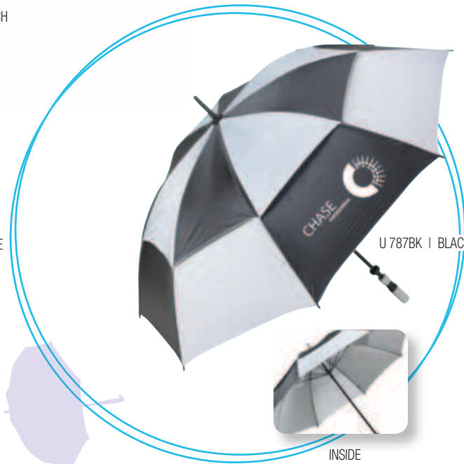
U 787BK | BLACK