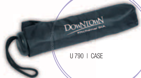
U 790 | CASE