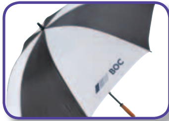
U788 UMBRELLA 248