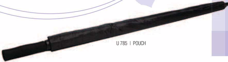
U 785 | POUCH