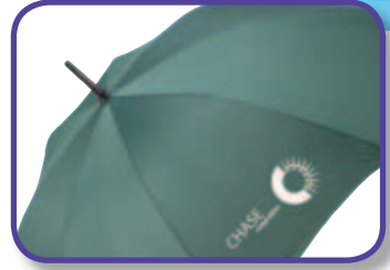
U793 UMBRELLA 249