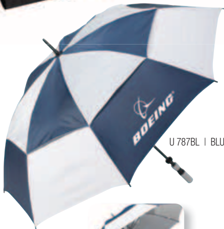
U 787BL | BLUE