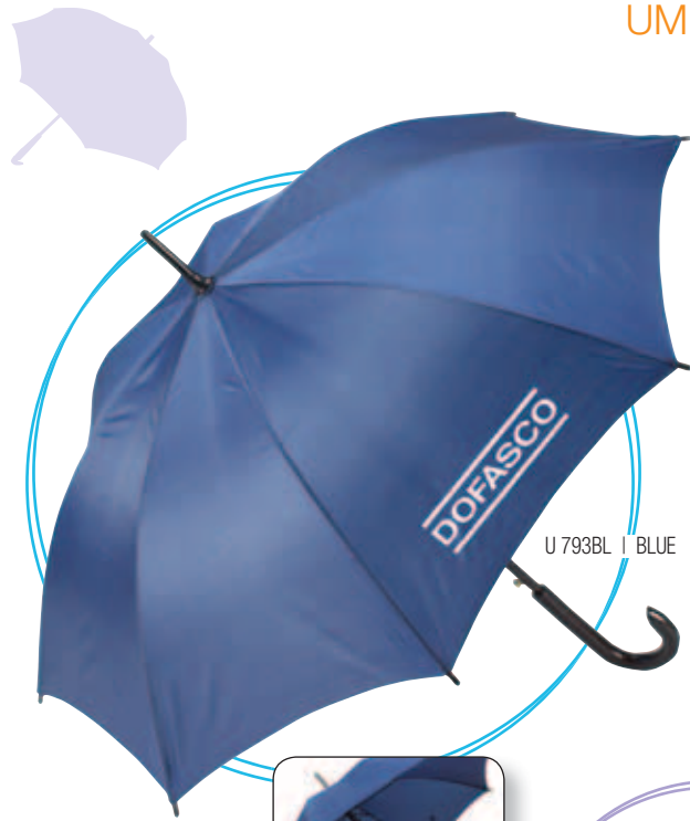
U 793BL | BLUE