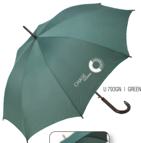
U 793GN | GREEN