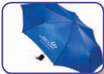
U790 UMBRELLA 247