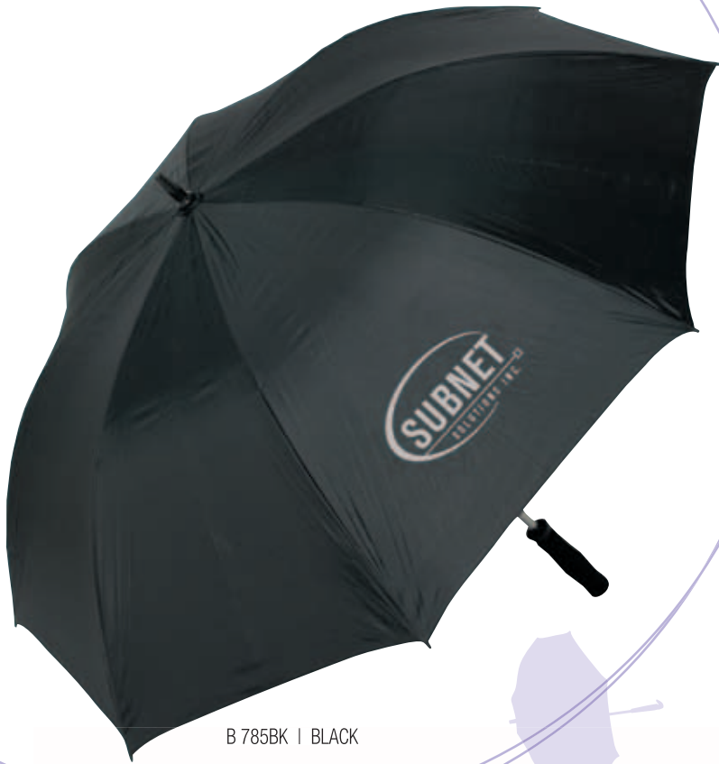
B 785BK | BLACK