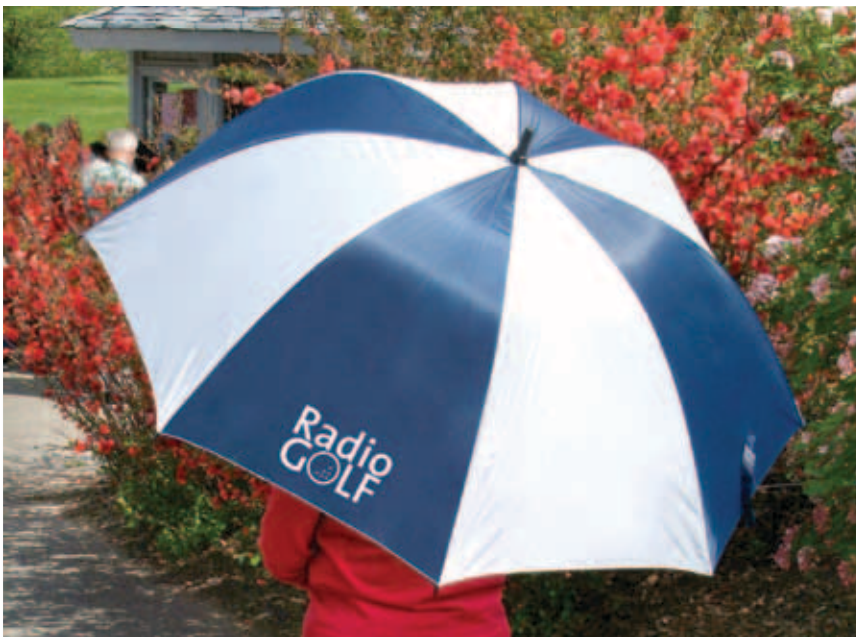
B 785BL | BLUE